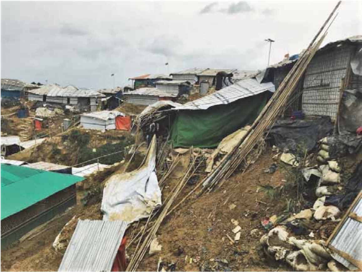
A landslide in the Kutupalong-Balukhali Expansion Camp in Cox's Bazar, Bangladesh on May 18, 2018 washed away a shelter housing 17 Rohingya refugees, all of whom were unharmed. The next day, shown here, refugees were working to put up a new hut on the same spot.