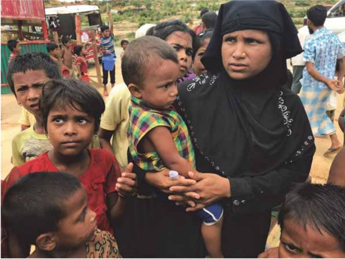
Rohingya woman seeking medical attention for her child at the Kutupalong-Balukhali Expansion Camp, May 2018.