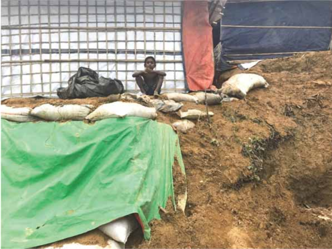
A Rohingya boy looks down on the place where his hut washed away the day before in the Kutupalong-Balukhali Expansion Camp in Cox's Bazar, Bangladesh, May 2018.