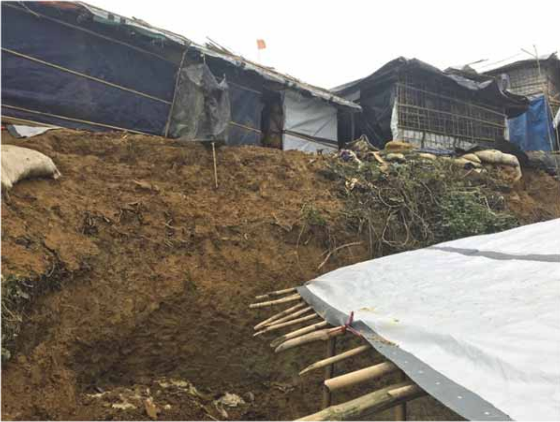
Site of a landslide in the Kutupalong-Balukhali Expansion Camp in May 2018 in Cox’s Bazar, Bangladesh. The next day, the refugees began constructing a new hut—in the right foreground—where their former hut had washed away. They had asked permission to relocate to a safer place, but the local authority told them they had to stay in the same overcrowded block, where no other place was available.

refugees to maintain community ties and to move between the mega camp and the new smaller ones; and, of great importance to the refugees, they would still be relatively close to the border with Myanmar to maintain their aspirations for return.