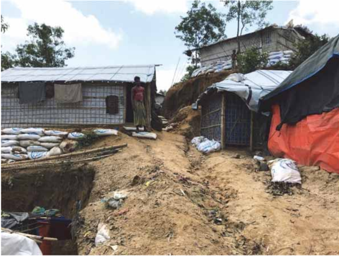
Especially when it rains, eroded gullies and lack of steps and handrails make for treacherous walking in the Kutupalong-Balukhali Expansion Camp in Cox's Bazar, Bangladesh, May 2018.

conditions are not yet in place” and welcomed the MOU as a “first step to address the root causes of the conflict in Rakhine.” 124 Even with the secretary-general’s assurances, the lack of transparency regarding the drafting and final terms of the MOU raises serious concerns about its provisions and does not engender trust for refugees anxious about their futures.