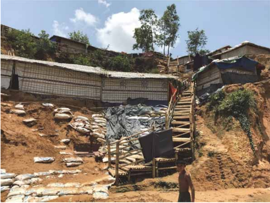
Walkways on the steep slopes of the Kutupalong-Balukhali Expansion Camp in Cox's Bazar, Bangladesh have been particularly treacherous. In May 2018, refugees in some places were starting to build stairs with handrails.

Bangladesh ratified the United Nations Convention on the Rights of Persons with Disabilities (CRPD) and its Optional Protocol in 2008. Under article 11 of the CRPD, Bangladesh is responsible for ensuring the protection and safety of persons with disabilities in situations of risk, including armed conflict, humanitarian emergencies, and natural disasters. 94