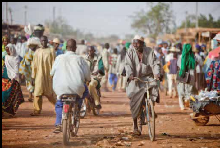
People from villages around the region converge on the town of Djibo in northern Burkina Faso every Wednesday on market day.

Since 2016, armed Islamist groups have dramatically increased their presence in Burkina Faso, where they have attacked government institutions, clashed with security forces, executed suspected collaborators, and intimidated teachers. In response to the growing threat, Burkinabé security forces have conducted counterterrorism operations in 2017 and 2018 that have resulted in numerous alleged abuses including extrajudicial killings, abuse of suspects in custody, and arbitrary arrests. The violence, concentrated in the northern Sahel region and the capital, Ouagadougou, has claimed scores of lives. This report, “By Day We Fear the Army, By Night the Jihadists,” contains disturbing testimony of the abuses and describes how communities feel trapped between often-abusive actors on both sides. It recommends that the government open investigations into incidents of alleged human rights violations and take measures to prevent further abuses. It further urges Burkina Faso’s international partners to call upon the government to conduct prompt and credible investigations.