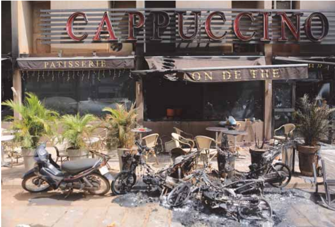
Armed Islamist groups Al-Qaeda and Al-Mourabitoun claimed the January 15, 2016 attack on the “Cappuccino” restaurant and cafe in Ouagadougou, which killed 30 people and left more than 70 wounded.