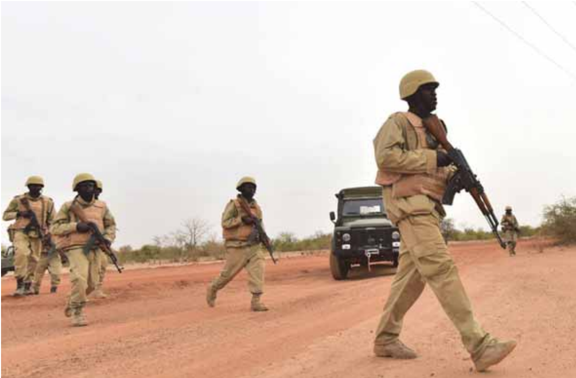
Soldiers from Burkina Faso take part in a training exercise in Burkina Faso on April 13, 2018.

under the direct command of the Army Chief of Staff. Security sources said GFAT’s troops rotate from field bases every three months. 48