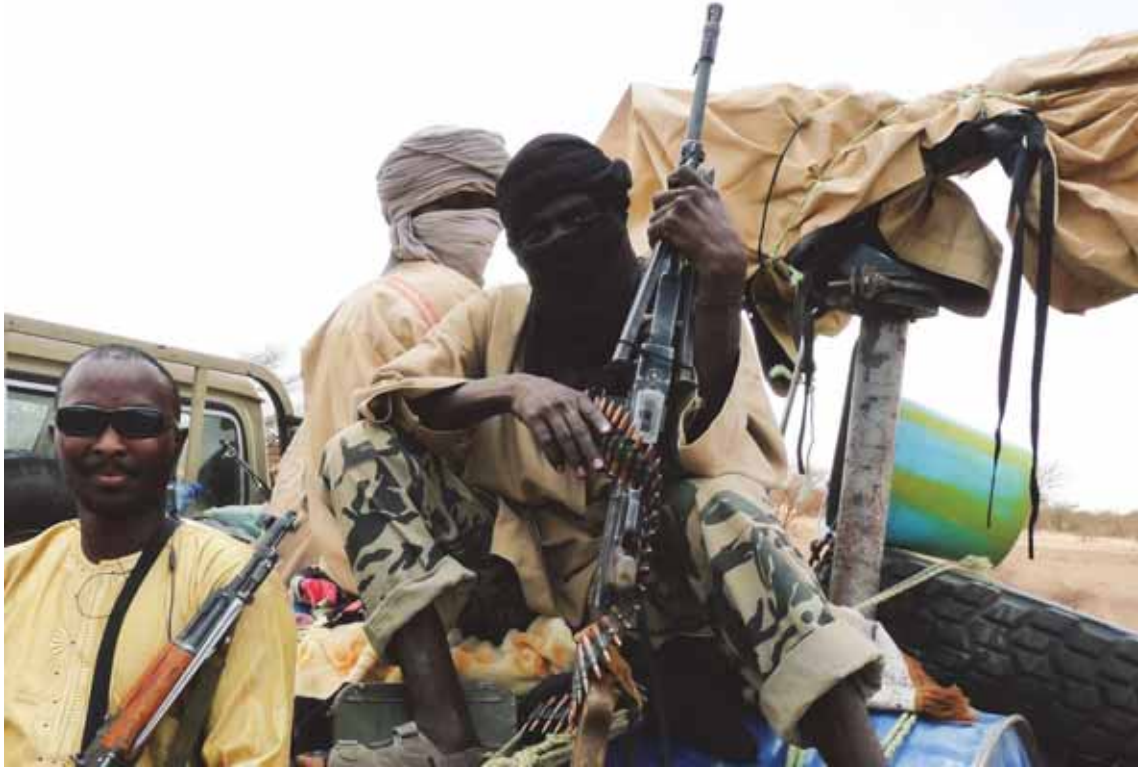
Combatants from Al-Qaeda-affiliated Islamist group Ansar Dine sit in a vehicle in Gao in northeastern Mali. The growing presence of armed Islamist groups in Burkina Faso is linked to insecurity in neighboring Mali, where northern regions fell to separatist Tuareg and Al-Qaeda-linked armed groups in 2012.