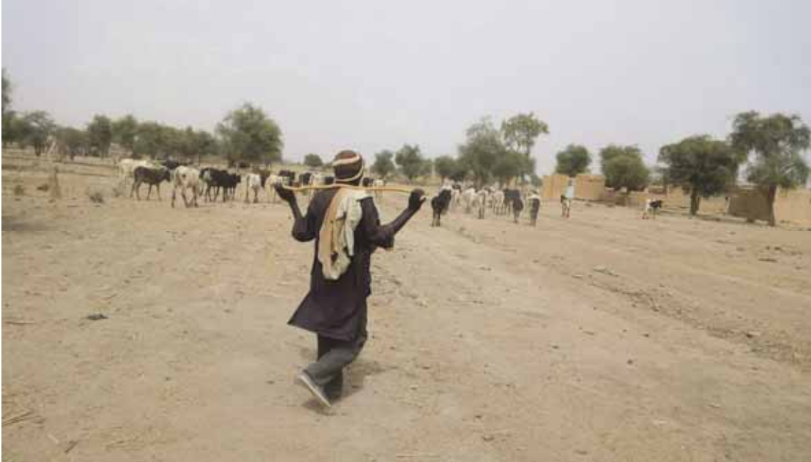
A Peuhl herder shepherds his cows in the Soum province of Burkina Faso. The vast majority of the victims of abuses by both the armed Islamists and the security forces are ethnic Peuhl, whose communities are largely located in the north of Burkina Faso.

led to the arrest or death of a suspect by the security forces. A few former Al-Irchad members were allegedly killed for refusing to support the group’s evolution into Ansaroul Islam. Some of those killed represented the social classes and clans Al-Irchad had long-denounced, while a few others were reportedly killed by the armed Islamists to settle personal scores. Banditry, notably cattle theft, accompanied some of these incidents.