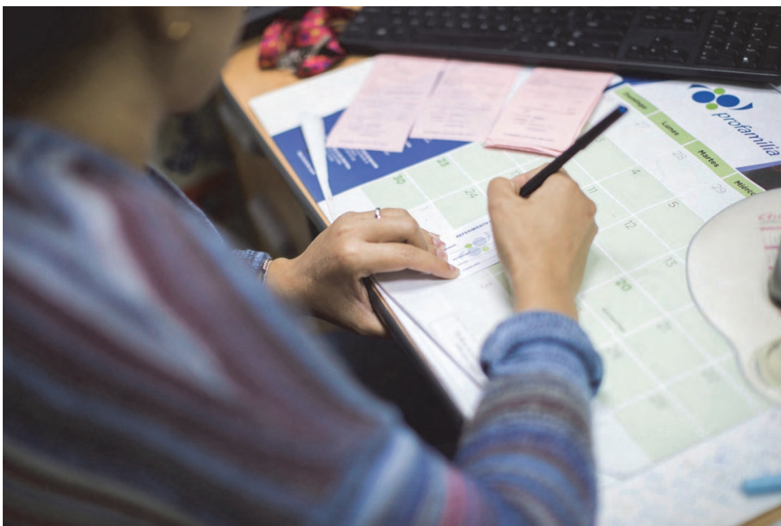
A counselor writes down a patient's information while discussing contraceptive options at a clinic in Santo Domingo, Dominican Republic.