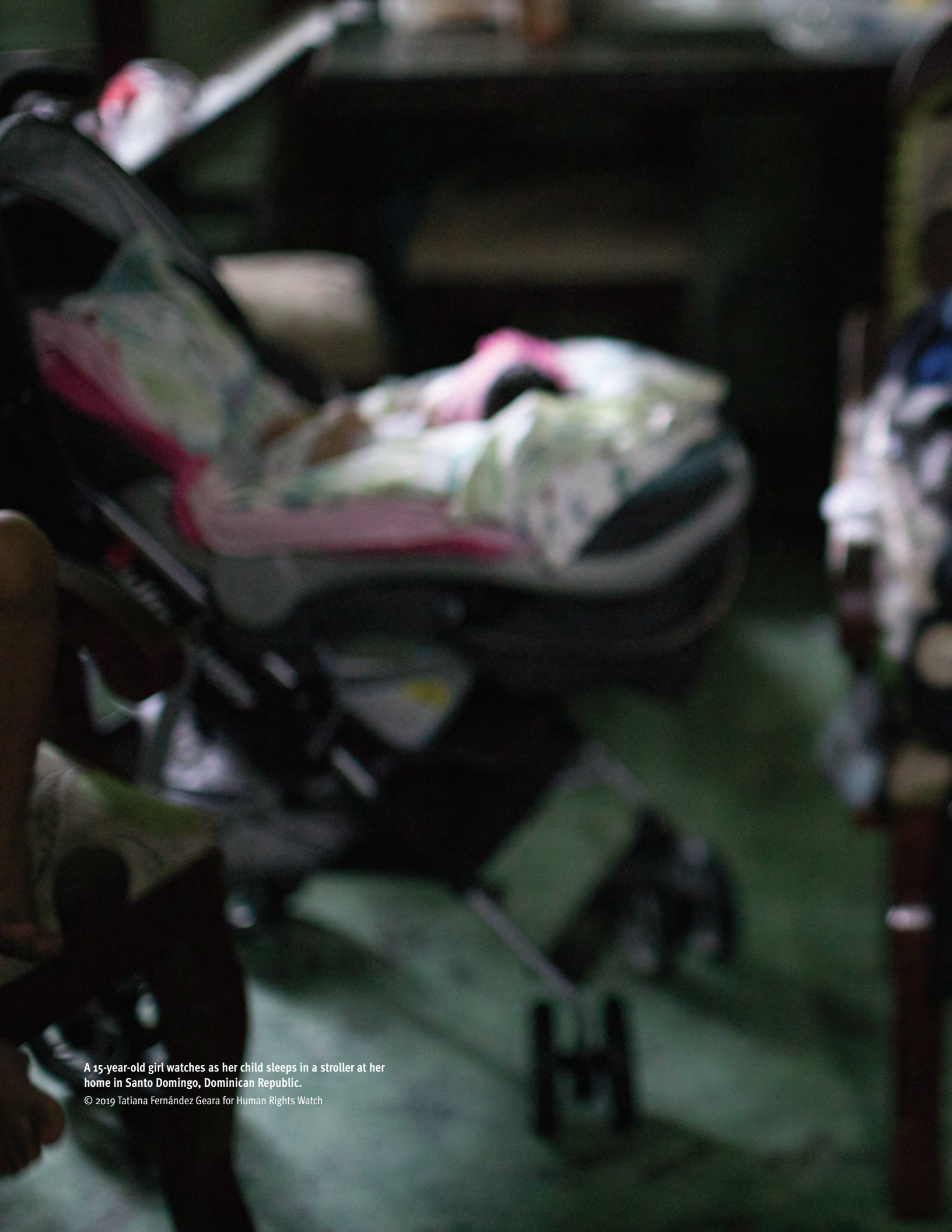
A 15-year-old girl watches as her child sleeps in a stroller at her home in Santo Domingo, Dominican Republic.