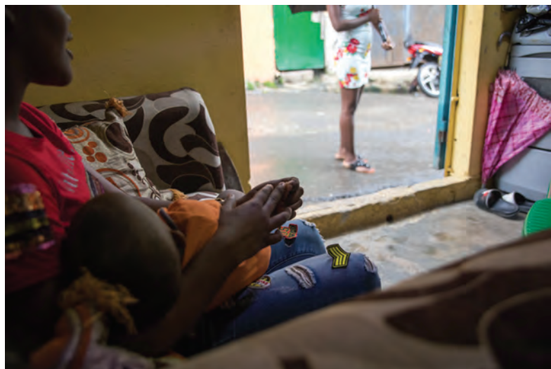
A young woman, 18, holds her son and talks to a friend in her neighborhood in Santo Domingo, Dominican Republic. She left school when she first became pregnant, but now takes classes on Sundays while her partner watches her child.