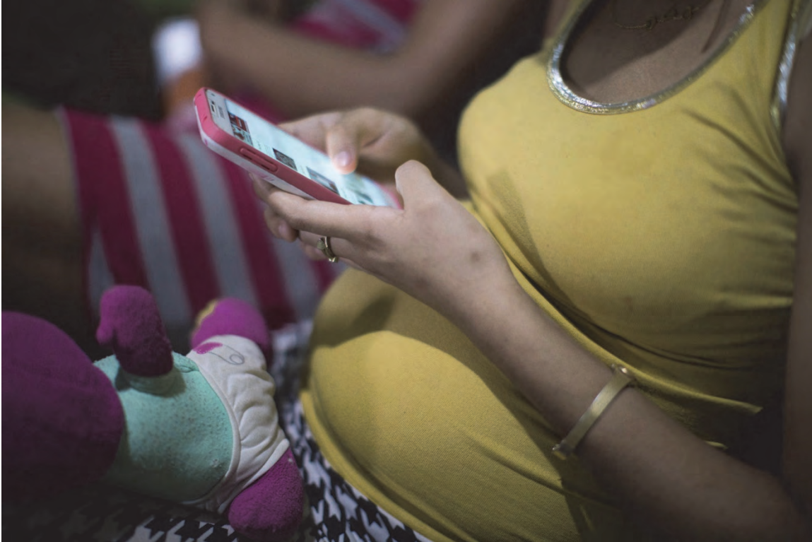
A pregnant 17-year-old girl checks her phone at her home in Santo Domingo, Dominican Republic.

An obstetrician-gynecologist in Santo Domingo specializing in adolescent health told Human Rights Watch that adolescent pregnancies have a higher risk of hemorrhage because the pelvis may be narrow and underdeveloped. She also explained that adolescent girls often learn they are pregnant later than adult women, because they may not recognize the signs as readily, leading to weeks or months of pregnancy without the recommended nutritional and vitamin intake, such as folic acid, a vitamin that can help prevent certain complications in fetal development. 62