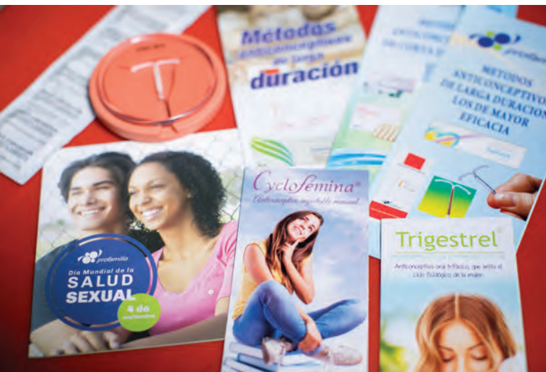
Information on sexual health and contraceptive methods at a clinic in Santo Domingo, Dominican Republic.