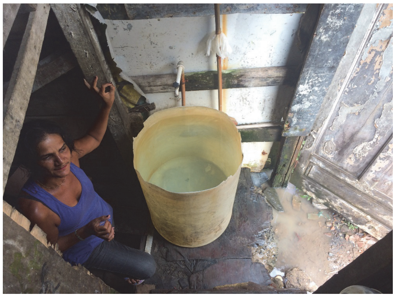
Lindasselva lives in a shack in a slum in Olinda, Pernambuco state. There are no sanitation services and she has access to water from only one tap. Mosquitos can breed and proliferate in stored water, if it is not properly covered and maintained.

For this report, Human Rights Watch asked 60 people visiting health facilities in Pernambuco and Paraíba states and in poor neighborhoods around Recife and Campina Grande about their access to water in the diverse communities where they reside. Only about one-third of them said they had continuous access to water in their homes. The rest said that their water only flowed through the taps two or three days per week, or sometimes less frequently. One official in Recife's Secretariat of Sanitation confirmed that Passarinhos, one of the communities Human Rights Watch visited, has intermittent access to water. She said, "they say it is one day with water and five without, but we observe that it can be more than five days [without water]."<sup>134</sup> While not a representative sample, our