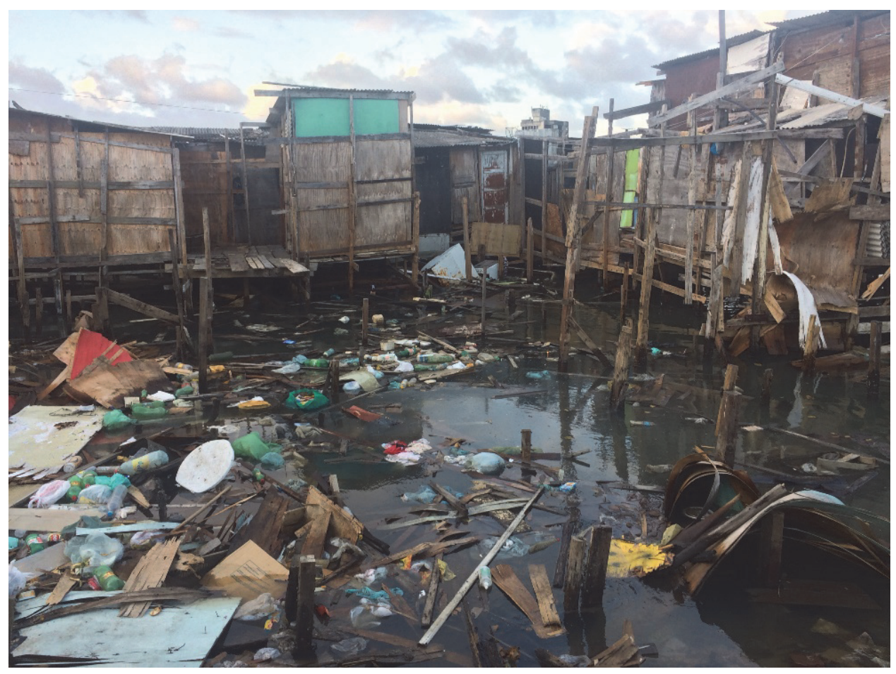
Wastewater and garbage are dumped directly into the river in a slum in the Coelhos neighborhood of Recife, Pernambuco state.

larval development and adult resting sites for mosquitos that can carry Zika and other viruses, and yet these are often not the focus of eradication efforts.<sup>144</sup>