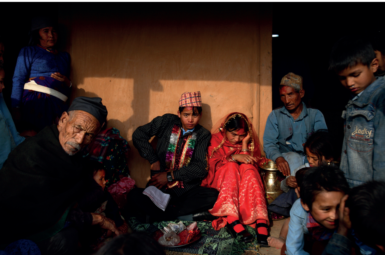
A 15-year-old boy accepts gifts from visitors as his new bride, 16, sits in their new home in Kagati Village, Kathmandu Valley, Nepal.

Afghanistan show that many women and girls are afraid to seek help from justice or security departments because they fear further abuse or being forcibly returned home.