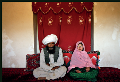
Cover Photo: A 40-year-old man and an 11-year-old girl sit in her home prior to their wedding in the rural Damarda Village, Ghor province, Afghanistan on Sept. 11, 2005. When asked how she felt that day, the girl responded, 'I do not know this man. What am I supposed to feel?'

Worldwide more than 50 million girls and young women between the ages of 15 and 19 are married. The majority of them live in sub-Saharan Africa and South Asia, in areas characterized by persistent poverty and low levels of economic development, but child marriage - a marriage in which one spouse is younger than 18 years of age - is found all over the world. Estimates are that worldwide, one girl out of seven is married before the age of fifteen, and some are as young as eight years old when forced to marry. Many get pregnant as a result of marital rape and forced sex, without understanding what is happening to their bodies. They must then care for their own children while they are still children themselves. Often, married girls drop out of school or are expelled, limiting their ability to learn skills to work later in life. Many suffer violence and face barriers in accessing justice and available legal protections. Tragically, in many cases, daughters of child brides are married before coming of age, reinforcing the same inequality and human rights violations suffered by their mothers.