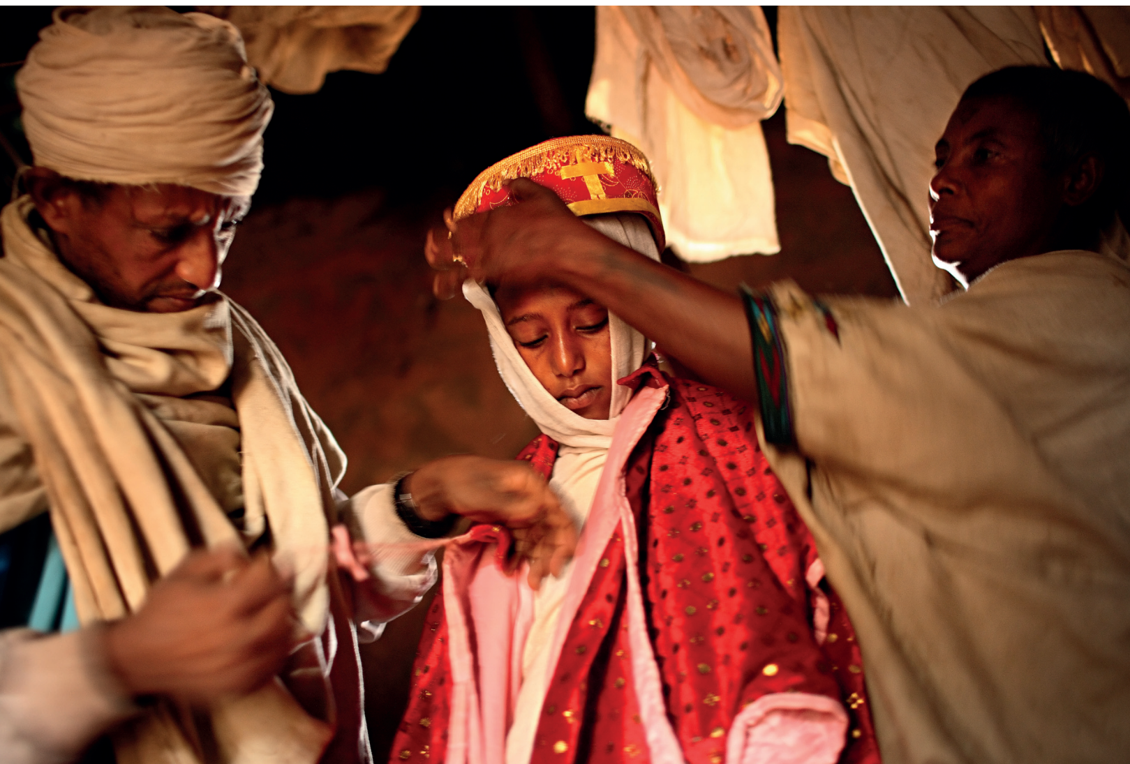
An 11-year old girl is married to a 23-year-old priest in a traditional Ethiopian Orthodox wedding in a rural area outside the city of Gondar, Ethiopia.