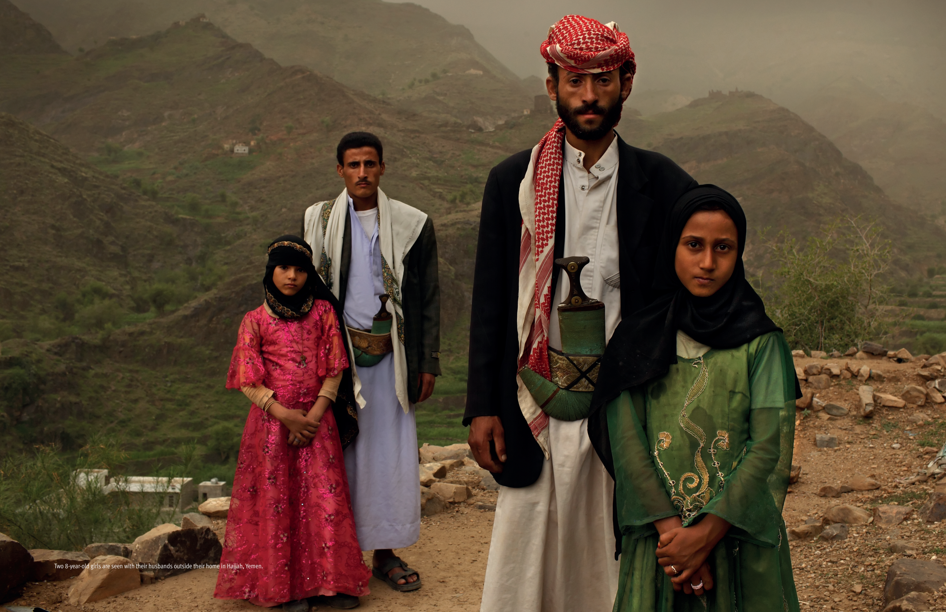
Two 8-year-old girls are seen with their husbands outside their home in Hajjah, Yemen.