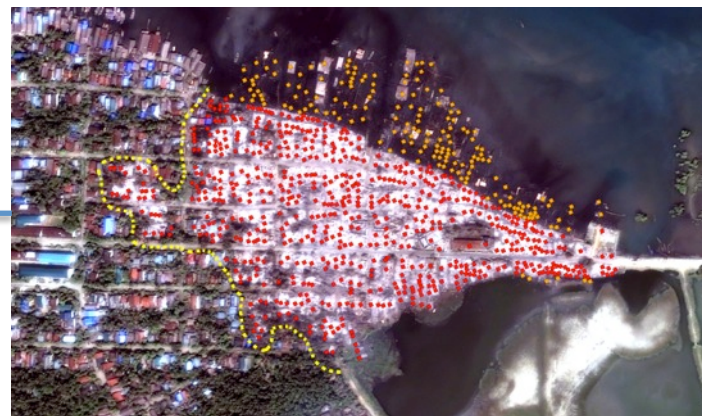
Damage Analysis: HRW; Image Copyright: DigitalGlobe 2012; Source: EUSI