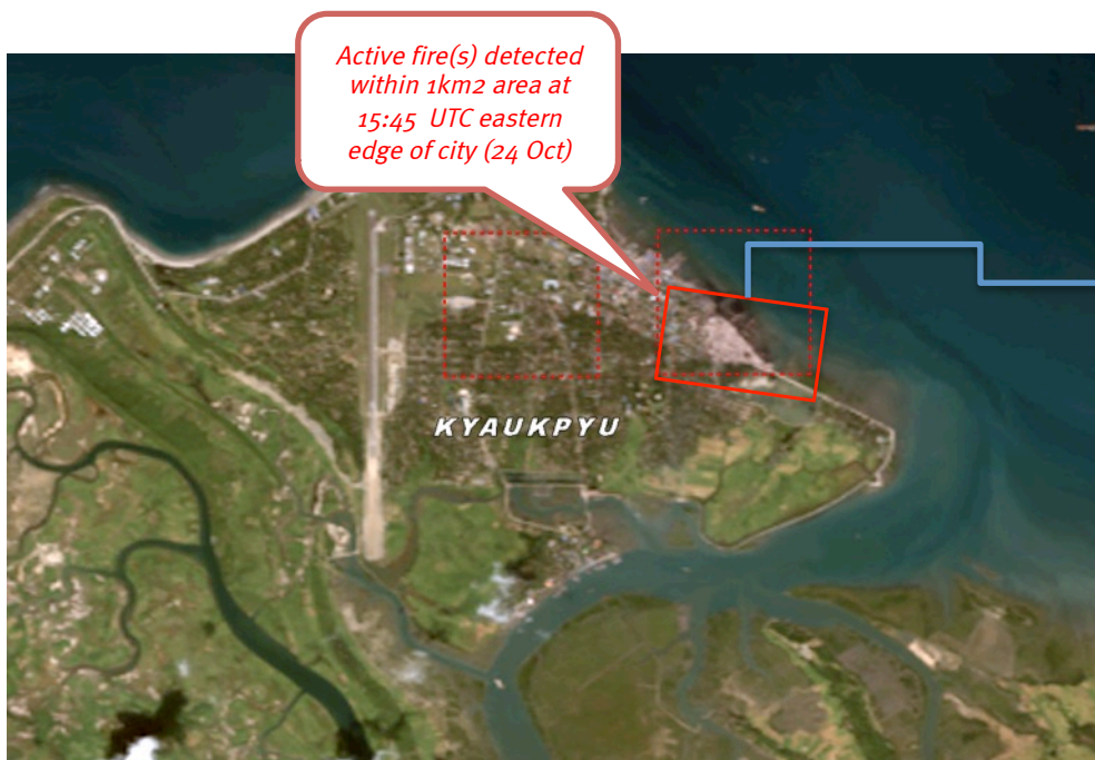
Damage Analysis: HRW; Image Copyright: DigitalGlobe 2012; Source: EUSI

Summary of main findings: A total of 811 destroyed building structures were identified on the eastern edge of Kyaukpyu city, likely caused by arson attacks occurring less than 24 hours earlier on 24 October 2012. This zone of near total destruction measures 14.4ha in area and included both normal buildings (633) as well as 178 house boats and floating barges adjacent on the water. There are no indications of building damages immediately to the west and east of this zone of destruction.