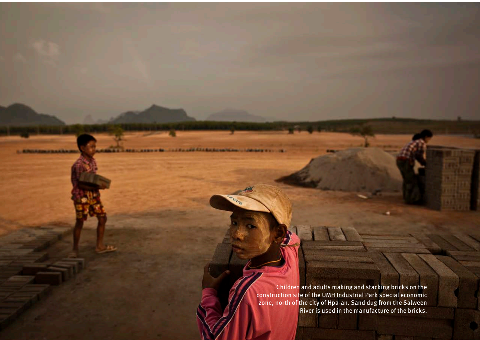
Children and adults making and stacking bricks on the construction site of the UMH Industrial Park special economic zone, north of the city of Hpa-an. Sand dug from the Salween River is used in the manufacture of the bricks.

armed group Karen National Union (KNU) or other militias and the government.