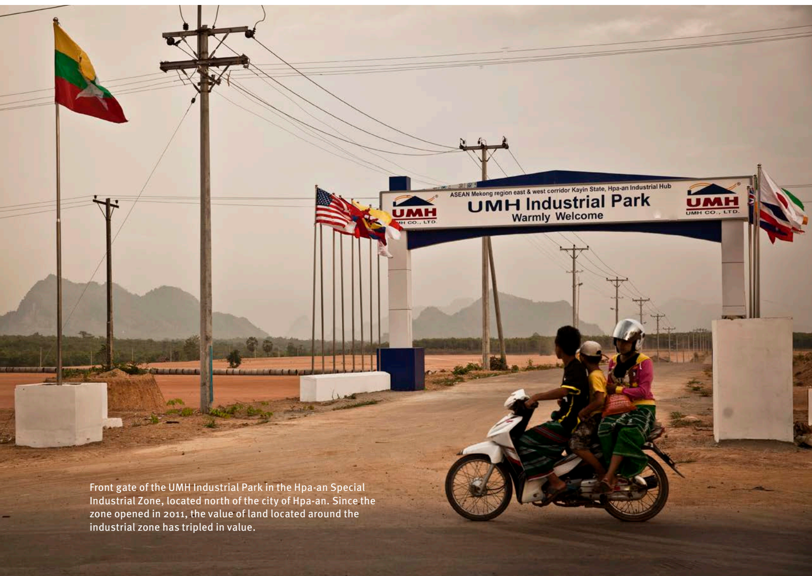
Front gate of the UMH Industrial Park in the Hpa-an Special Industrial Zone, located north of the city of Hpa-an. Since the zone opened in 2011, the value of land located around the industrial zone has tripled in value.

The economic opening of the country to investors has made land more valuable, while the peace process in Karen State and other ethnic areas has given access to areas previously beyond the reach of the Burmese armed forces and military-linked businessmen. The result is that powerful interests are gaining land through questionable means while farmers are losing it, often without adequate compensation.