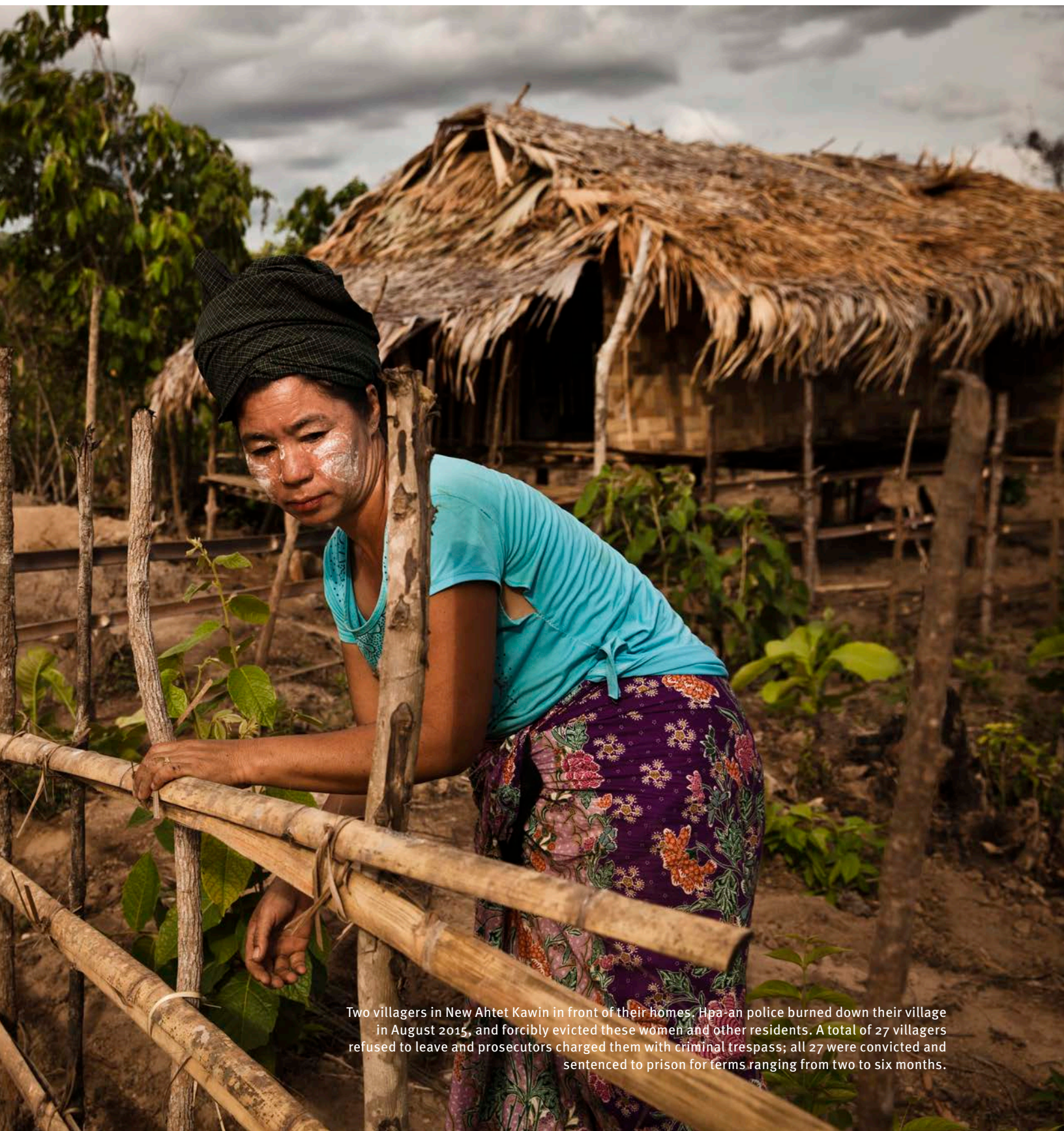
Two villagers in New Ahtet Kawin in front of their homes. Hpa-an police burned down their village in August 2015, and forcibly evicted these women and other residents. A total of 27 villagers refused to leave and prosecutors charged them with criminal trespass; all 27 were convicted and sentenced to prison for terms ranging from two to six months.