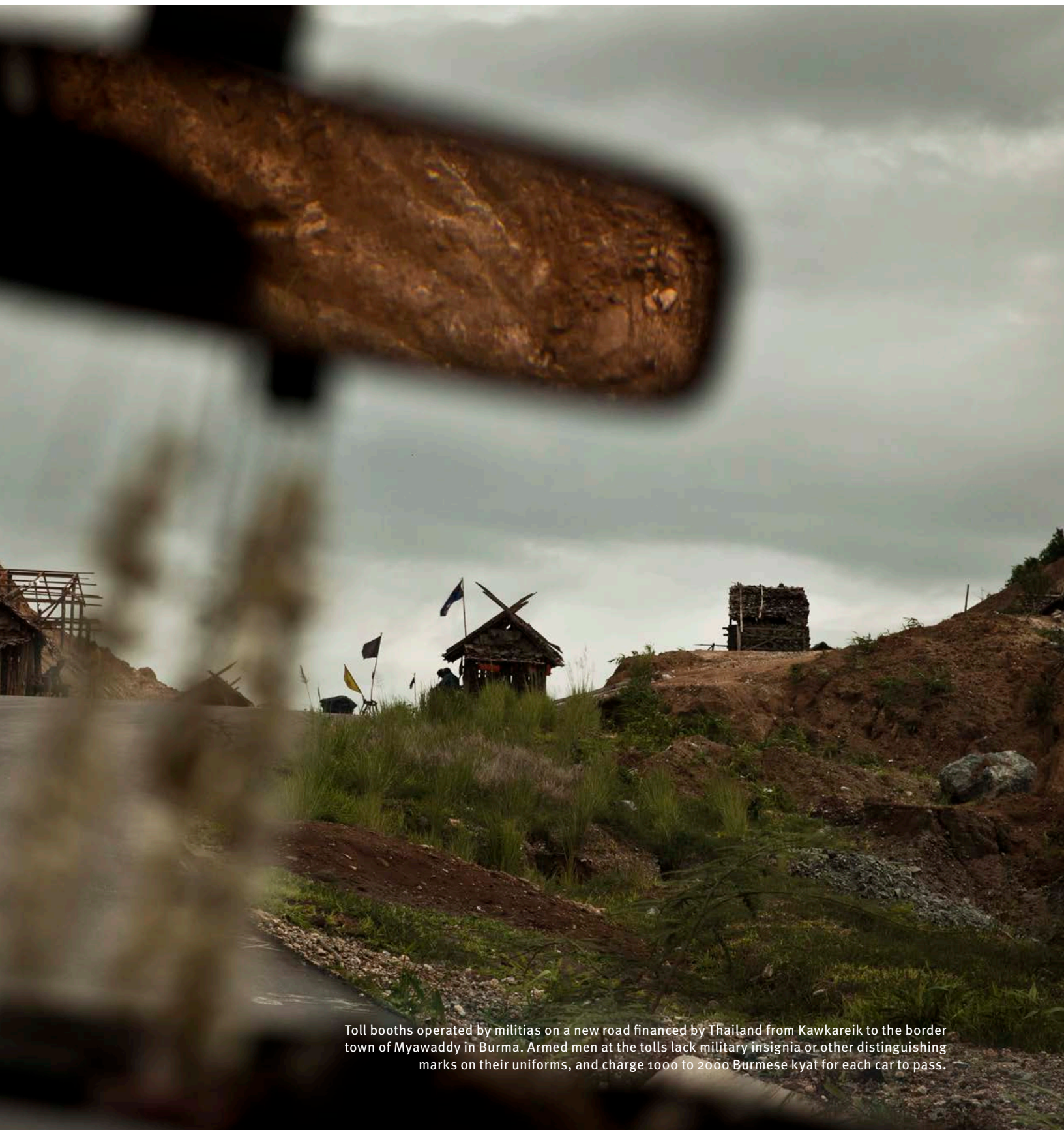
Toll booths operated by militias on a new road financed by Thailand from Kawkaik to the border town of Myawaddy in Burma. Armed men at the tolls lack military insignia or other distinguishing marks on their uniforms, and charge 1000 to 2000 Burmese kyat for each car to pass.