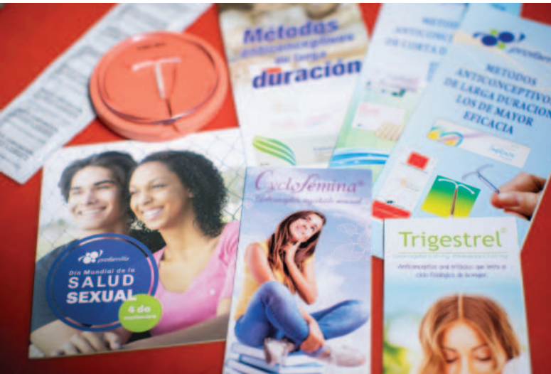
Information on sexual health and contraceptive methods at a clinic in Santo Domingo, Dominican Republic.