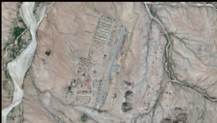
Satellite Imagery of the Sawa military camp, including the Warsai Yikealo Secondary School, recorded in January 2015.

Eritrea’s few international partners and donors should make clear that ongoing support will require concrete efforts by the government in these areas and push the government to establish independent, credible complaints mechanisms to investigate allegations of abuse of trainees and conscripts.