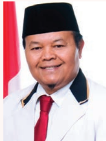
HIDAYAT NUR WAHID People’s Consultative Assembly Deputy Speaker

“The role of the parent is very important in order to guide their children away from violating nature... Especially as lately there have been many LGBT issues, which is considered a psychological illness. Adherents of LGBT should be returned to the appropriate nature of gender...”