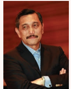
LUHUT PANDJAITAN Then-Political, Legal, Security Affairs Coordinating Minister

Called for legislation that “aims to prevent and protect society from the massive propaganda launched by the LGBT community. Their campaign has reached out on social media. We need a solution to deal with this situation—it is like a warning to us all.”