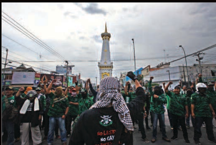
A group opposing the Lesbian, Gay, Bisexual and Transgender (LGBT) community prepares to confront a pro-LGBT group planning on staging a counter protest at Tugu Monument in Yogyakarta on Feb. 23.

Throughout the crisis, the administration of president Joko Widodo (Jokowi) remained largely silent, with the only public commentary by a high-ranking official being a suggestion that homosexuality was a medical disorder that needed treatment. That failure to adequately respond to the public attacks on the country’s LGBT community falls short of Indonesia’s international human rights obligations, and the government’s commitment to respecting and celebrating the country’s diversity.