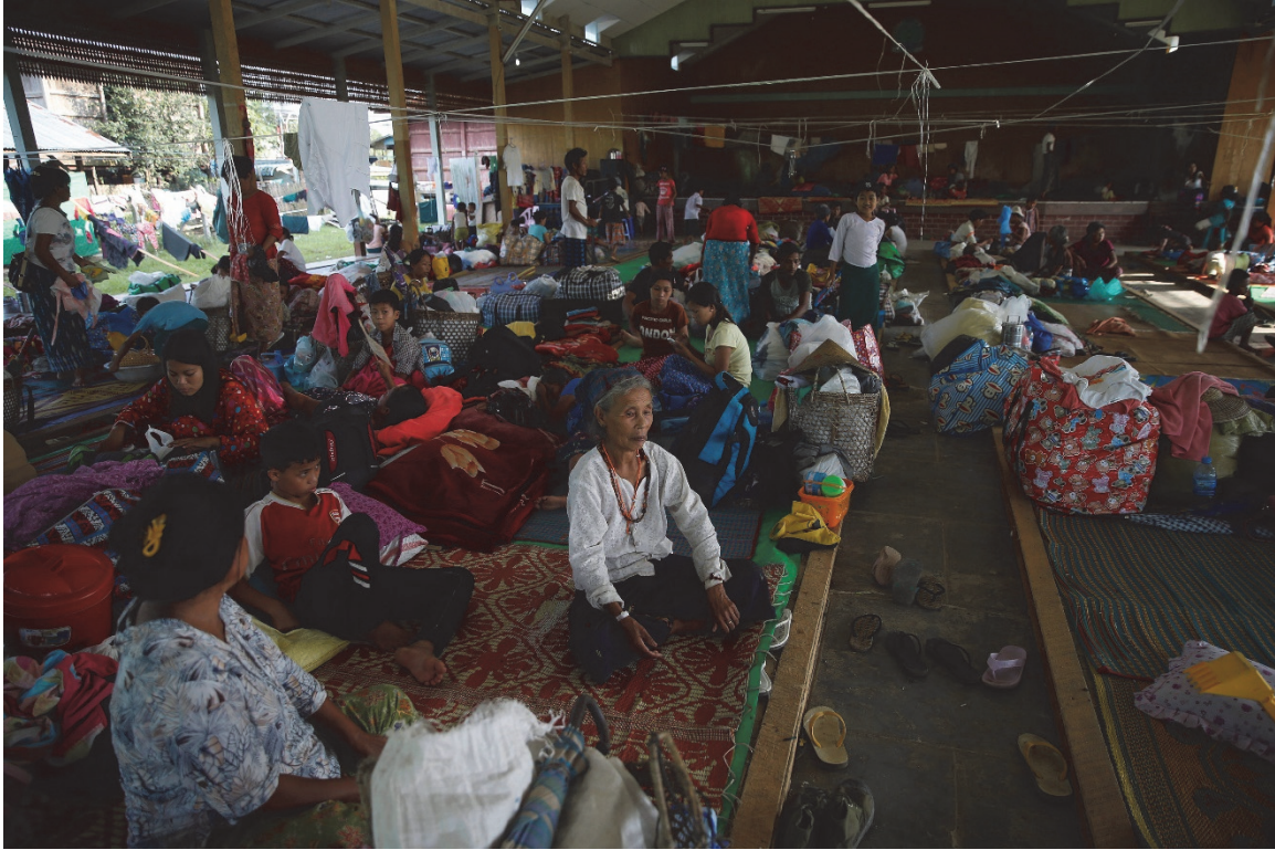
Families displaced by the conflict between the Myanmar army and the Kachin Independence Army (KIA) at a church in Tanai township, Kachin State, Myanmar, June 2017.