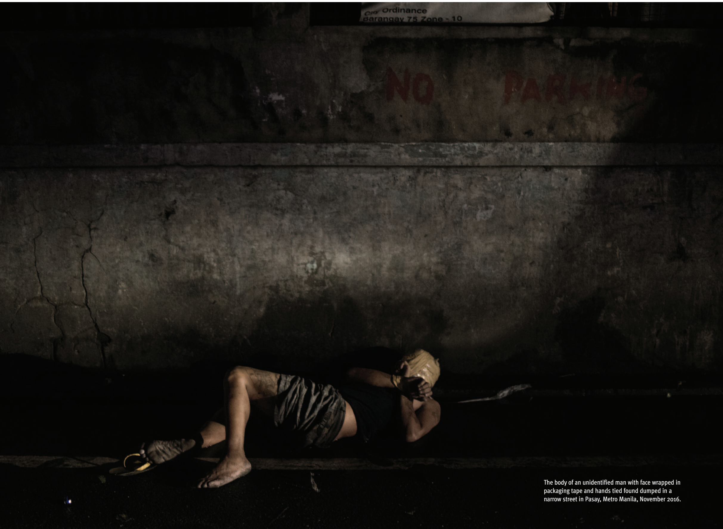
The body of an unidentified man with face wrapped in packaging tape and hands tied found dumped in a narrow street in Pasay, Metro Manila, November 2016.