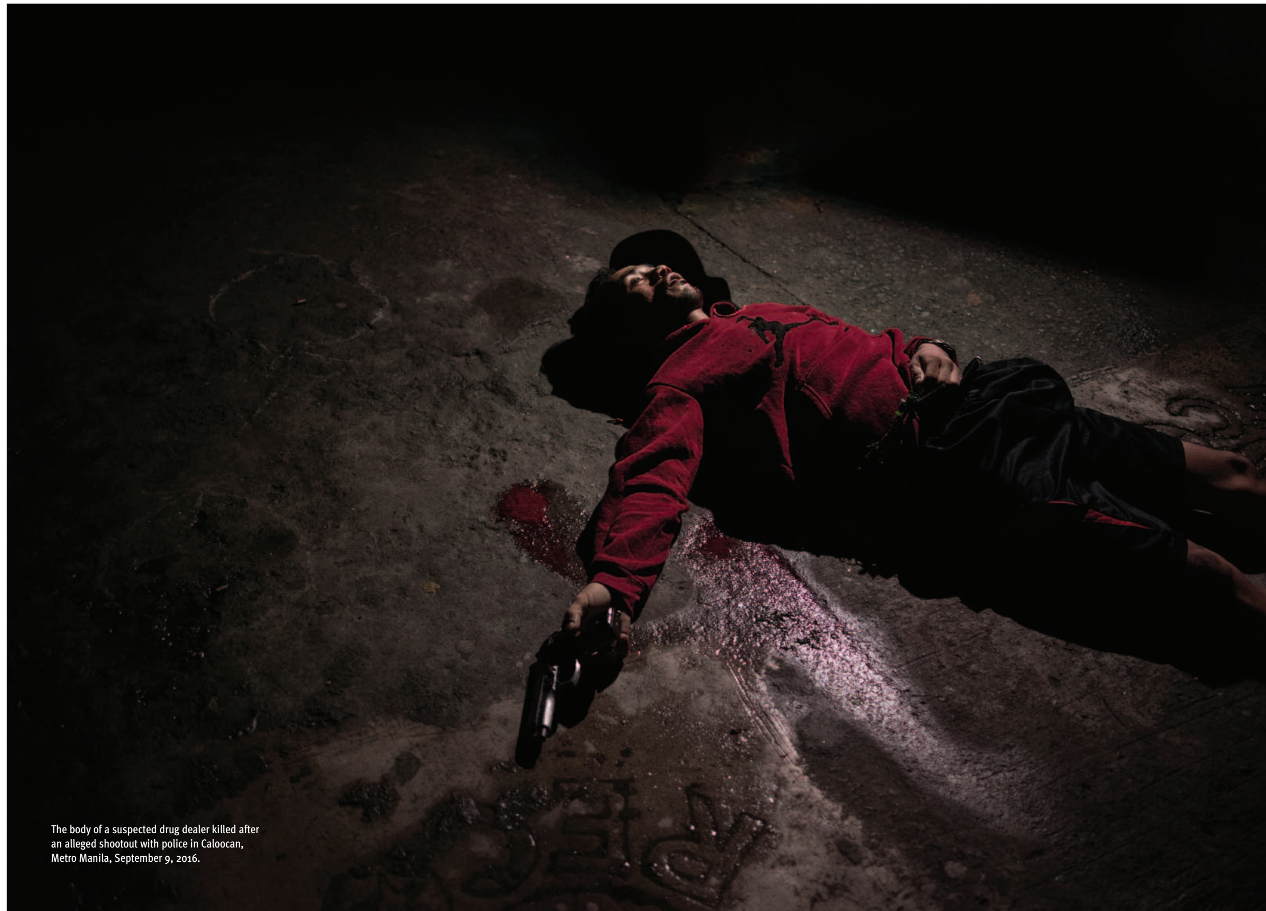
The body of a suspected drug dealer killed after an alleged shootout with police in Caloocan, Metro Manila, September 9, 2016.

Relatives, neighbors, and other witnesses told Human Rights Watch that armed assailants typically worked in groups of two, four, or a dozen. They would wear civilian clothes, often all black, and have their faces shielded by balaclava-style headgear or other masks, and baseball caps or helmets. They would bang on doors and barge into rooms, but the assailants would not identify themselves or provide warrants. Family members reported hearing beatings and their loved ones begging for their lives. The shooting could happen immediately—behind closed doors or on the street; or the gunmen might take the suspect away, where minutes later shots would ring out and local residents would find the body; or the body would be dumped elsewhere later, sometimes with hands tied or the head wrapped in plastic. Local residents often said they saw uniformed police on the outskirts of the incident, securing the perimeter—but even if not visible before a shooting, special crime scene investigators would arrive within minutes.