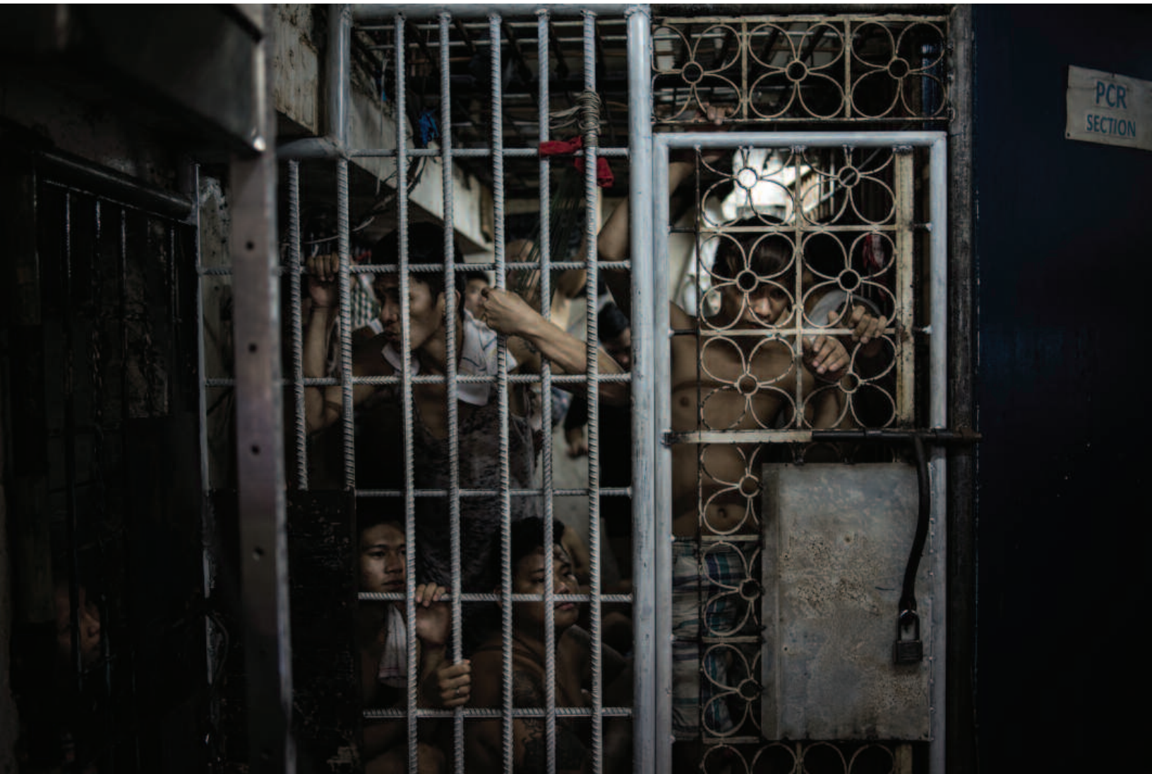
Detainees in Police Station 6 in Santa Ana, Manila, July 27, 2016.