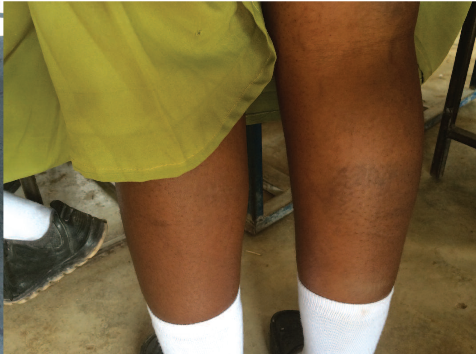
A girl shows the marks she sustained on her legs from regular caning by teachers in her school. She told Human Rights Watch: “We have marks in the legs, they hit our hands, they hit us on the head.”

But it is only one of several short- to long-term measures needed to fully realize the right to secondary education for