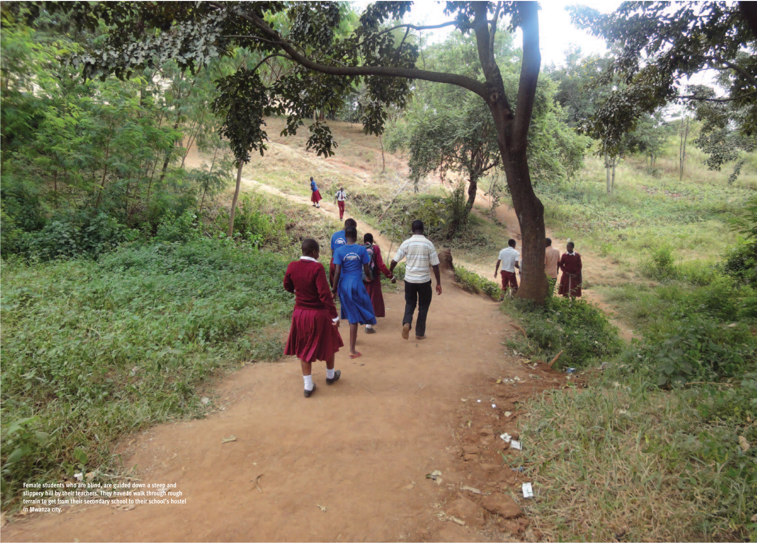
Female students who are blind, are guided down a steep and slippery hill by their teachers. They have to walk through rough terrain to get from their secondary school to their school’s hostel in Mwanza city.

Girls Face Sexual Harassment, Discrimination, and Expulsion Due to Pregnancy or Marriage: Less than a third of girls that enter lower-secondary school graduate. Many girls are exposed to widespread sexual harassment by