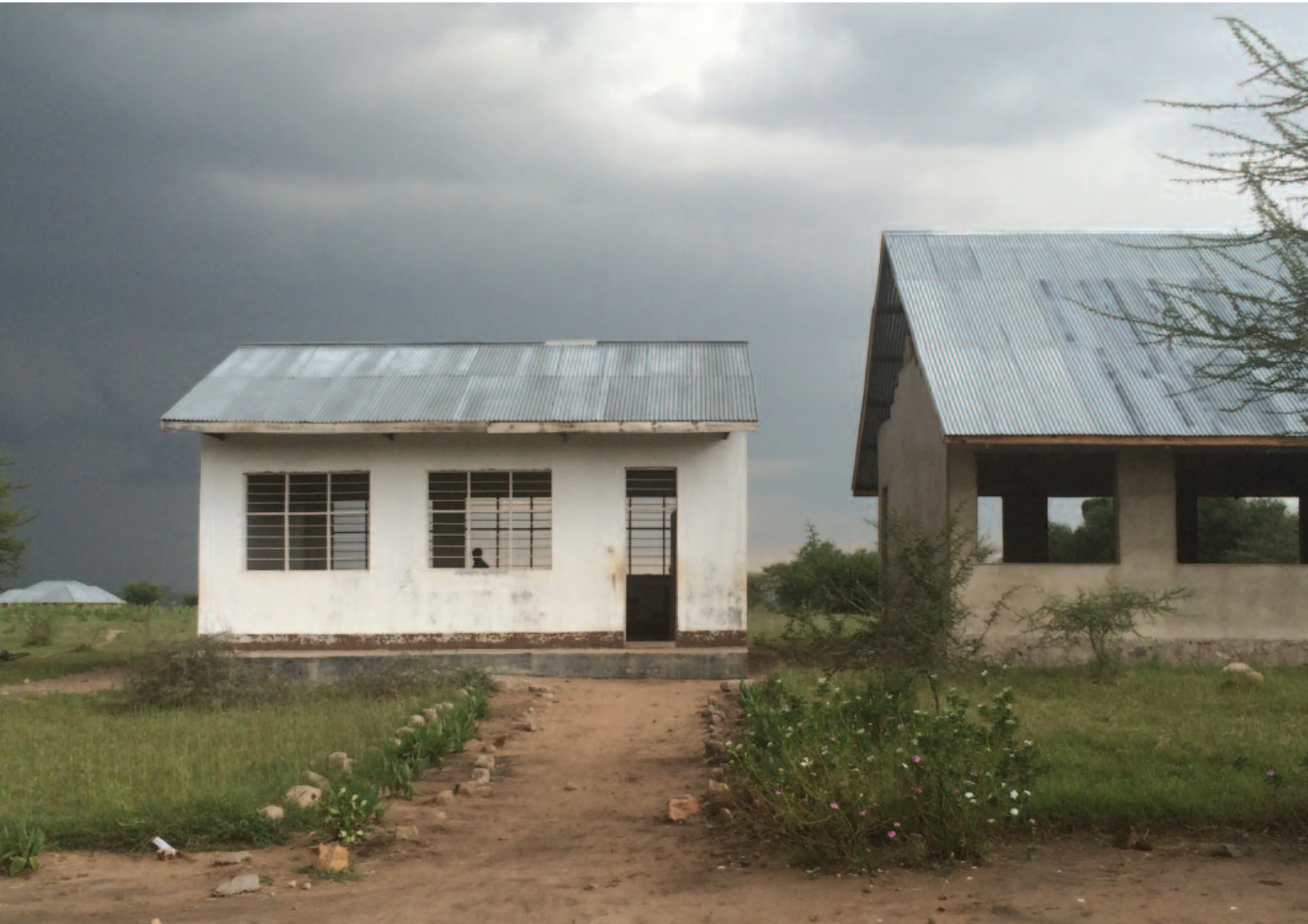
An unfinished science laboratory next to a classroom at a secondary school in Shinyanga region, northern Tanzania. Construction work was put on hold when school officials were no longer allowed to ask parents for financial contributions following the government’s abolition of school fees and “contributions” in December 2015.

pursue this option. Formal vocational training requires the successful completion of lower-secondary education and is costly. Other vocational training courses are limited in quality, scope, and use.