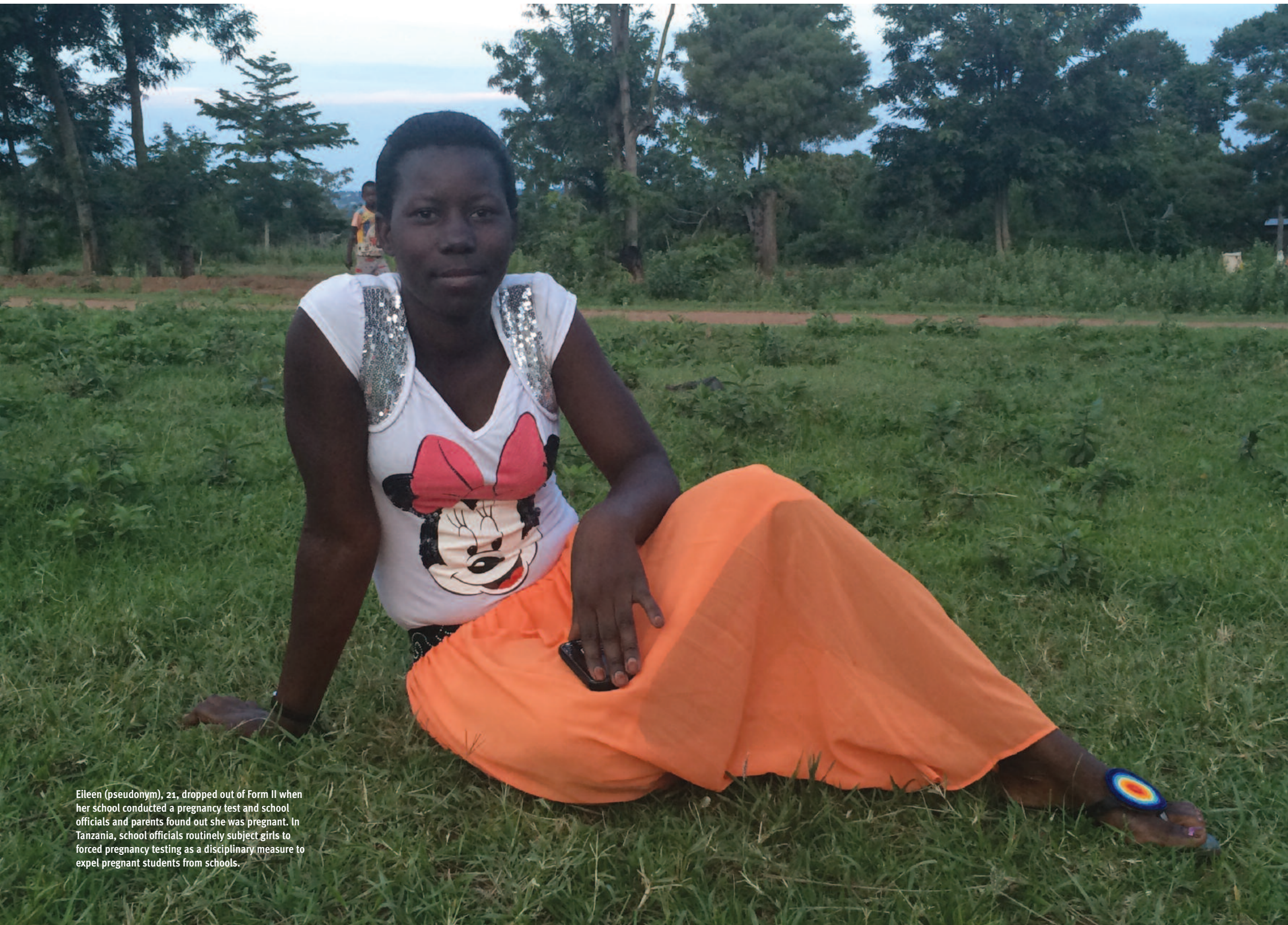
Eileen (pseudonym), 21, dropped out of Form II when her school conducted a pregnancy test and school officials and parents found out she was pregnant. In Tanzania, school officials routinely subject girls to forced pregnancy testing as a disciplinary measure to expel pregnant students from schools.

Education has been a national priority for successive Tanzanian governments since independence. Tanzania has one of the world’s largest young populations, and its young people are at the heart of its aspiration to become a middle-income country by 2025.