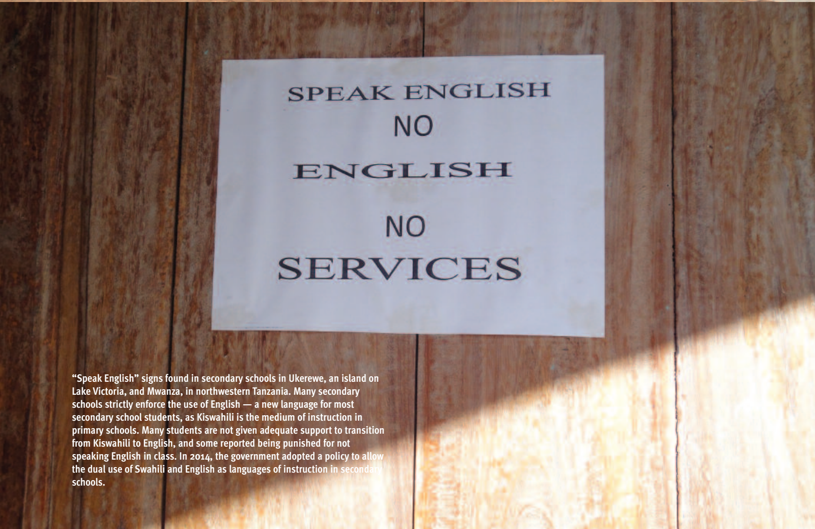
“Speak English” signs found in secondary schools in Ukerewe, an island on Lake Victoria, and Mwanza, in northwestern Tanzania. Many secondary schools strictly enforce the use of English — a new language for most secondary school students, as Kiswahili is the medium of instruction in primary schools. Many students are not given adequate support to transition from Kiswahili to English, and some reported being punished for not speaking English in class. In 2014, the government adopted a policy to allow the dual use of Swahili and English as languages of instruction in secondary schools.