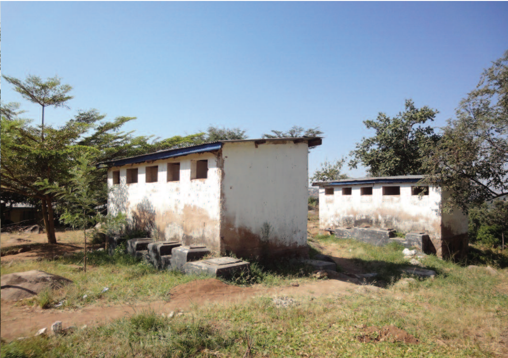
Old female and male latrines at a secondary school in Mwanza, northeastern Tanzania. Safe and adequate toilets and sanitation facilities are a basic component of an acceptable learning environment, but in many secondary schools, toilets do not meet any basic standards. Many students interviewed by Human Rights Watch reported having to use dirty and congested pit latrines.

pursue this option. Formal vocational training requires the successful completion of lower-secondary education and is costly. Other vocational training courses are limited in quality, scope, and use.