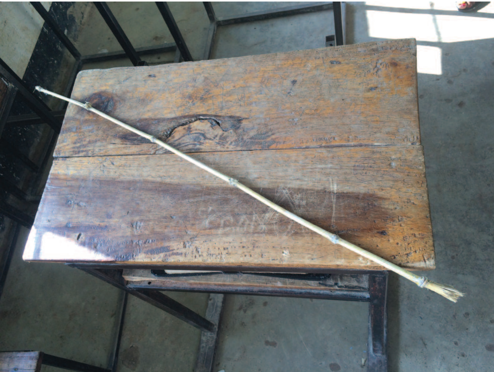
A bamboo cane used by a teacher to cane students in a classroom lies on a desk at a secondary school in Mwanza, northwestern Tanzania. Human Rights Watch found that some teachers also beat students with wooden sticks, or with their hands or other objects.

The abolition of school fees is one of the most important actions taken by the government to implement its ambitious education goals. Tanzania’s 2014 Education and Training policy aims to increase access to primary and secondary education, and to improve the quality of education. These goals are in line with the Sustainable Development Goals (SDGs), a United Nations initiative which sets a target for all countries to offer all children free, equitable, and quality primary and secondary education by 2030. The goals are also in line with Tanzania’s international and regional human rights obligations to realize the right to primary and secondary education for all.