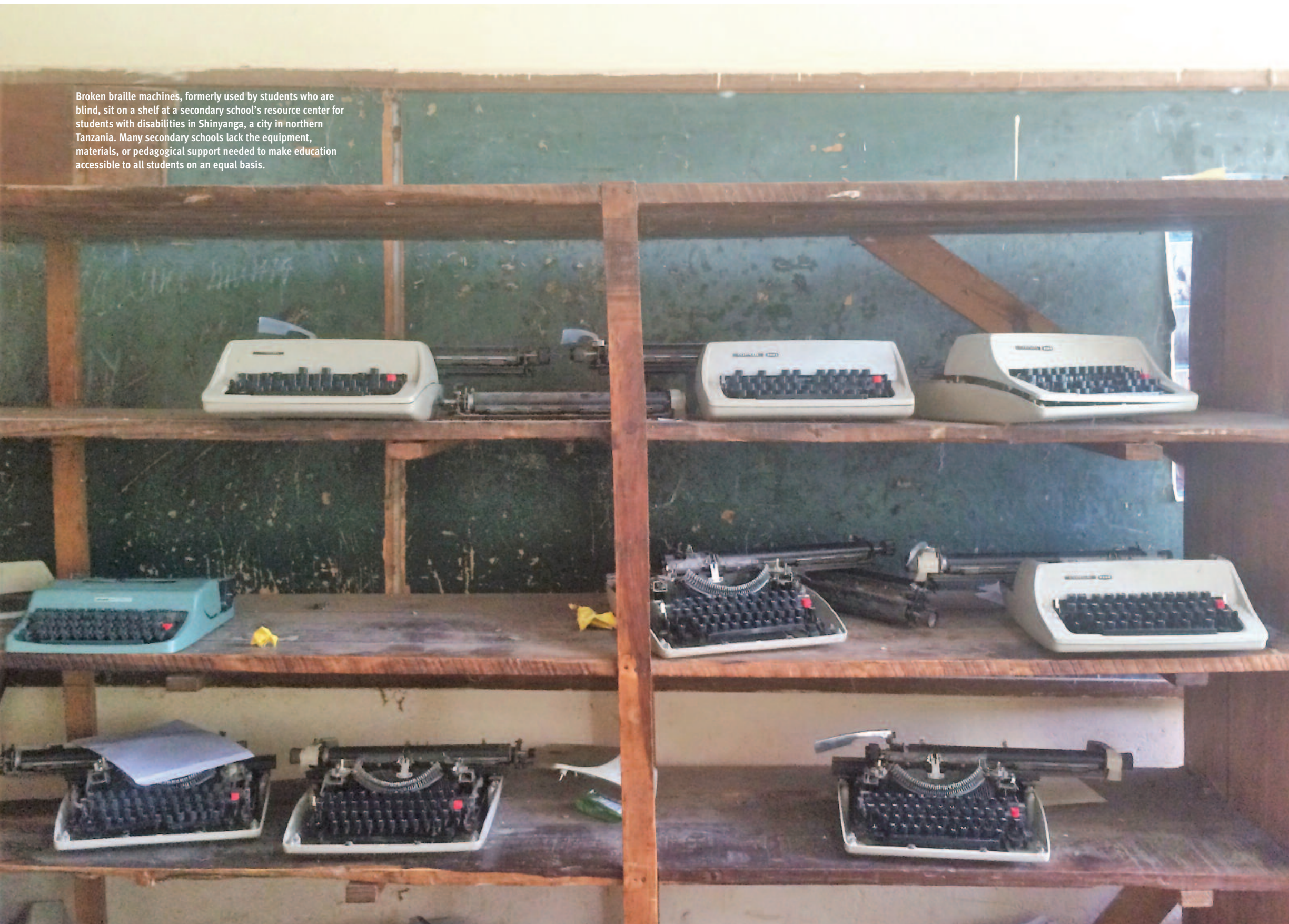
Broken braille machines, formerly used by students who are blind, sit on a shelf at a secondary school’s resource center for students with disabilities in Shinyanga, a city in northern Tanzania. Many secondary schools lack the equipment, materials, or pedagogical support needed to make education accessible to all students on an equal basis.

teachers. Many also face sexual exploitation and abuse by bus drivers and adults who often ask them for sex in exchange for gifts, rides, or money, on their way to school. In some schools, officials do not report cases of sexual abuse to police, and many schools lack a confidential mechanism to report abuse. Many, and perhaps most, schools force girls to undergo pregnancy testing in school and expel girls when they find out they are pregnant. Girls who are married are also expelled according to the government’s expulsion guidelines. Once out, girls struggle to get back into education because of discrimination and stigma against adolescent mothers, financial challenges, and the absence of a re-admission policy for young mothers of compulsory schooling age. Girls also lack access to adequate sanitation facilities, a particular problem for menstrual hygiene, and often miss school during their monthly periods.