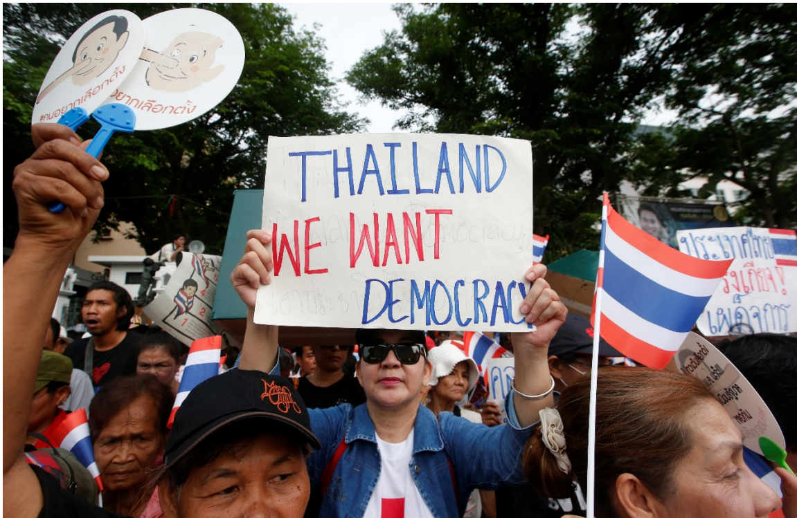
Thai pro-democracy protesters marking the fourth anniversary of the military coup, May 22, 2018.