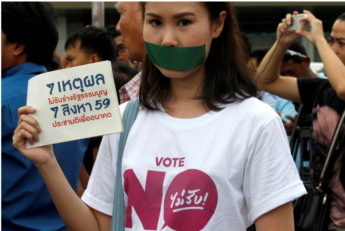
Thai activist Nuttaa Mahattana protests the junta-backed constitution ahead of the August 7, 2016 referendum in Bangkok, June 15, 2016.