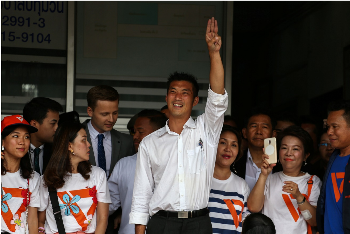
Thanathorn Juangroongruangkit, leader of the Future Forward Party, flashes a three-finger salute to his supporters as he leaves a police station after hearing a sedition complaint filed by the army, Bangkok, April 6, 2019.

the Criminal Code, and participating in an unlawful assembly of more than 10 people in violation of section 215 of the Criminal Code. 278 If convicted, he faces prison terms of up to seven years, two years, and six months respectively.