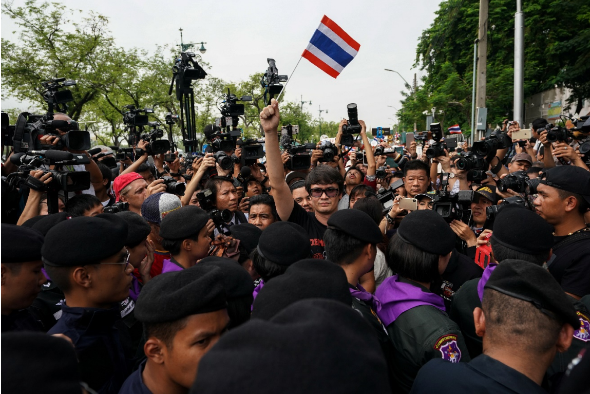
Pro-democracy activist Rome Rangsiman holds up a Thailand flag as anti-government protesters gather to demand that the military government hold a general election by November, in Bangkok, May 22, 2018.

“But many police blocked the road so we could not go out. We had around 600 people, but there were others who wanted to join the event but couldn’t enter because the police blocked them.” 335