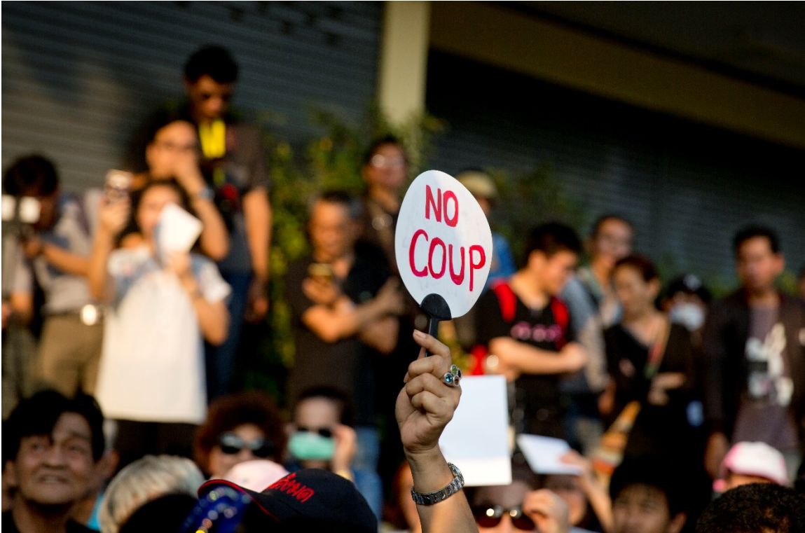
A protester raises a placard during a February 10, 2018 protest calling for Thailand's military rulers to hold elections.

On April 20, 2018, prosecutors formally charged Rangsiman Rome with sedition and violation of HNCPO order 3/2015. 313 On September 27, 2018, prosecutors formally charged Sirawit Seritiwat, Anon Numpa, Chonticha Chaengrew, Sukrid Peansuwan, Nuttaa Mahattana, and Karn Pongphraphapan with sedition and violation of HNCPO order 3/2015. 314